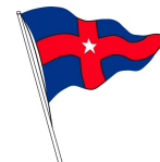
New York Yacht Club