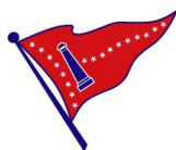
Ida Lewis Yacht Club